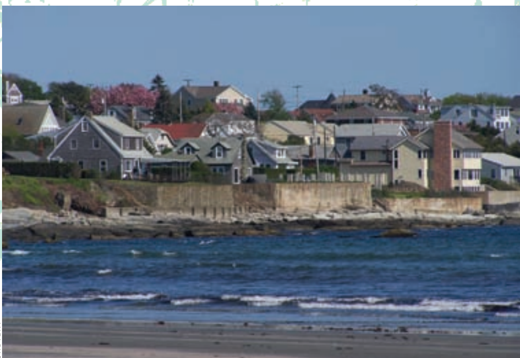
(Above) Stormwater runoff from dense coastal developments delivers pollutants straight to the beach. Newport, Rhode Island. (Opposite) A stormwater pipe discharges directly into the surf zone on the Outer Banks in North Carolina.